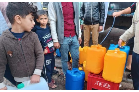
UAWC's distribution of drinking water in Rafah, Khan Yunis and Jabalia – Gaza.

Sourcing of Supplies: The supplies are sourced from local vendors and pre-war reserves, bolstering the economy, and enabling quicker aid deployment. Additionally, collaboration with local farms has illustrated the farming community's resilience under risk.