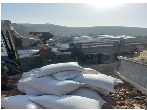
UAWC's distribution of animal fodder in Jenin – West Bank