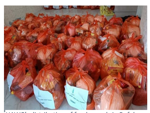
UAWC's distribution of food parcels in Rafah, Khan Yunis and Jabalia – Gaza.