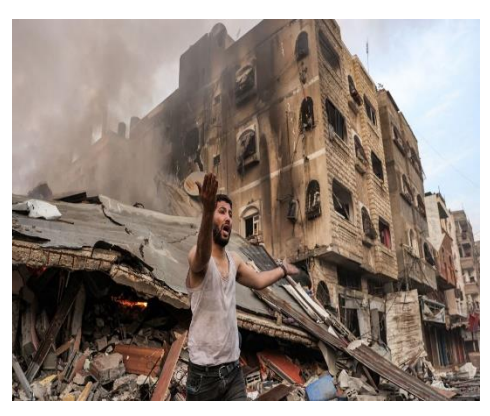
Destruction in Gaza.

The ongoing genocide war in Gaza for 74 days, commencing on October 7th, has escalated into a war of eradication, marked by an unprecedented scale of destruction and a deliberate targeting strategy. This war has tragically resulted in the loss of over 18,500 Palestinian lives, with over 51,000 injured, 70% of whom are children. The devastation extends beyond human casualties, with more than 60% of buildings in Gaza destroyed, over 10,000 people missing, and complete demolition of infrastructure across various areas.